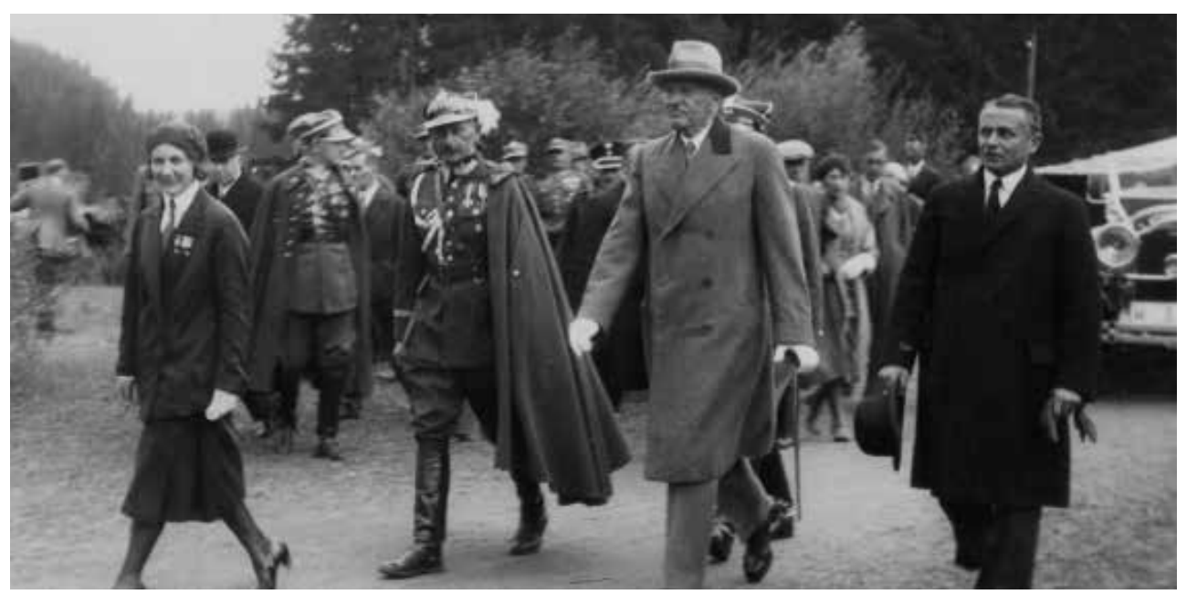
A camp of the Women's Military Training in Istebna, 1931

Headquarters of the Armed Resistance-Home Army. She had a hundred thousand girls from various organizations under her command. In 1944, she fought in the Warsaw Uprising and became a colonel. After the war, she was the head of the Women's Department of the General Headquarters of the Universal Organization "Service for Poland" initiative. In 1949, after false accusations were made against her, she was sent to prison. After release, she ran a "Ruch" kiosk in the building of the Polish Radio at Myśliwiecka Street in Warsaw. After the fall of communism in 1991, she was appointed a Brigadier General being the first woman in the history of the Polish Army to be awarded this esteemed position. In 2007, a monument in her name was erected at the Polish Army Museum in Warsaw.