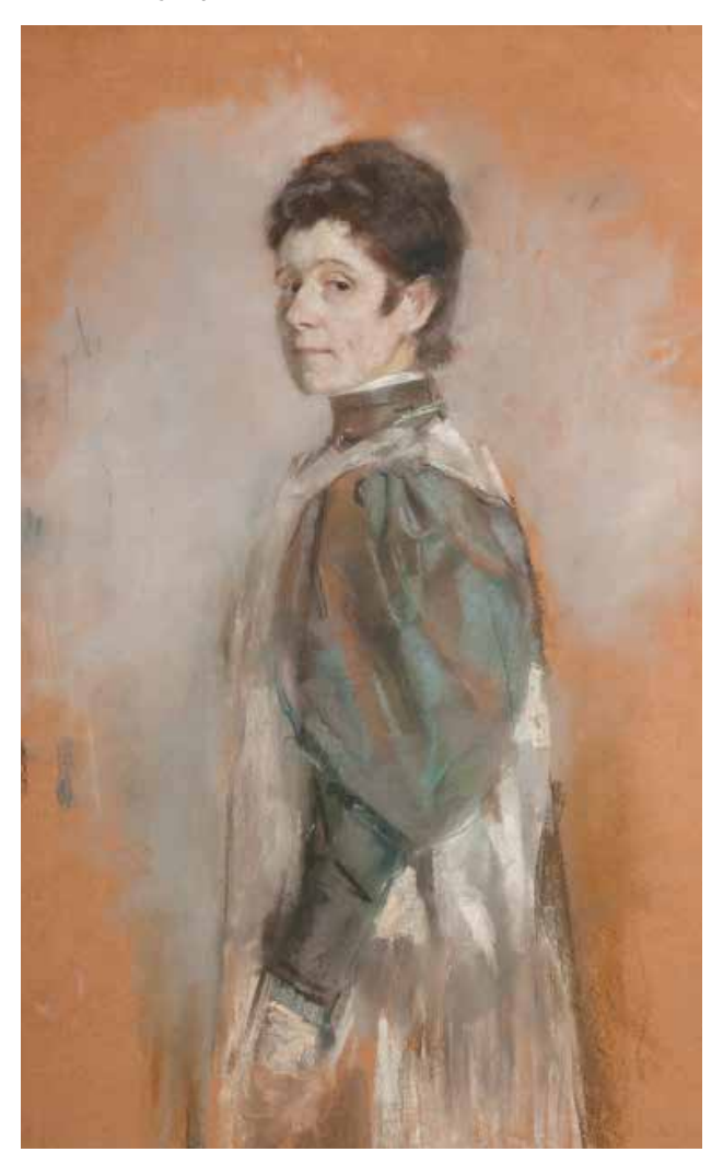
Boznańska, Self-portrait , 1906, Photography Studio, National Museum of Kraków

ing Polish painter and one of the best in Europe. Her works are still on exhibit in many museums in Poland and her legacy lives on.