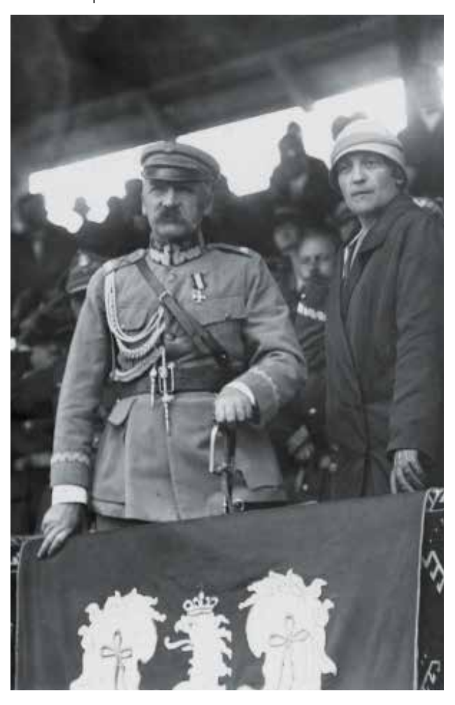
With Marshal Piłsudski during the 5th Convention of Legionists in Kielce, 1926

at the North Sheen Cemetery in London. In 1992, her ashes were brought to Poland and she rests in the Warsaw Powązki Cemetery. She left behind memoirs that were published in London in 1985.